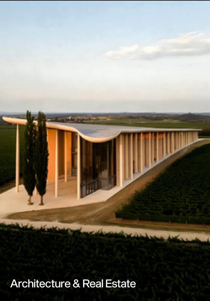
Architecture & Real Estate

Our services. Images that speak beyond words. They shape ideas, reveal intentions, and connect disciplines from architecture to artificial intelligence.