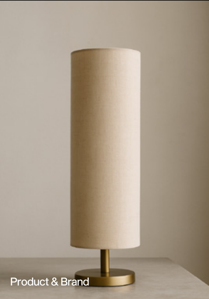
Product & Brand