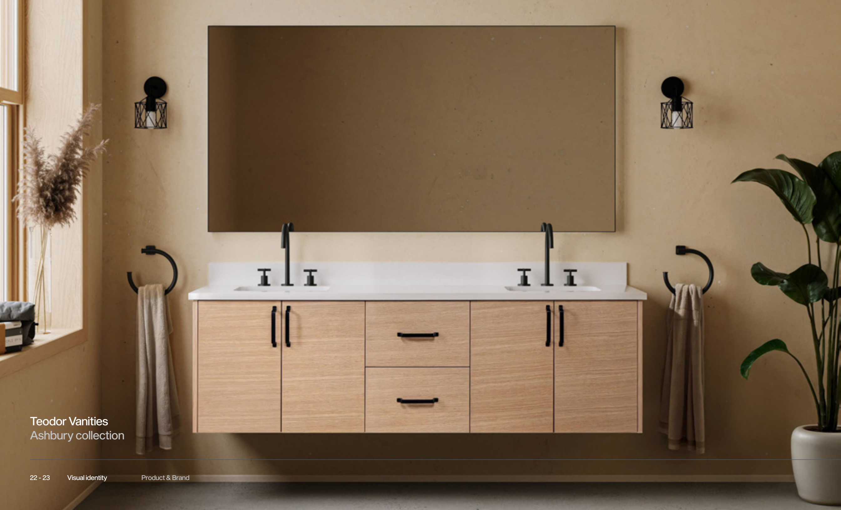
Teodor Vanities Ashbury collection