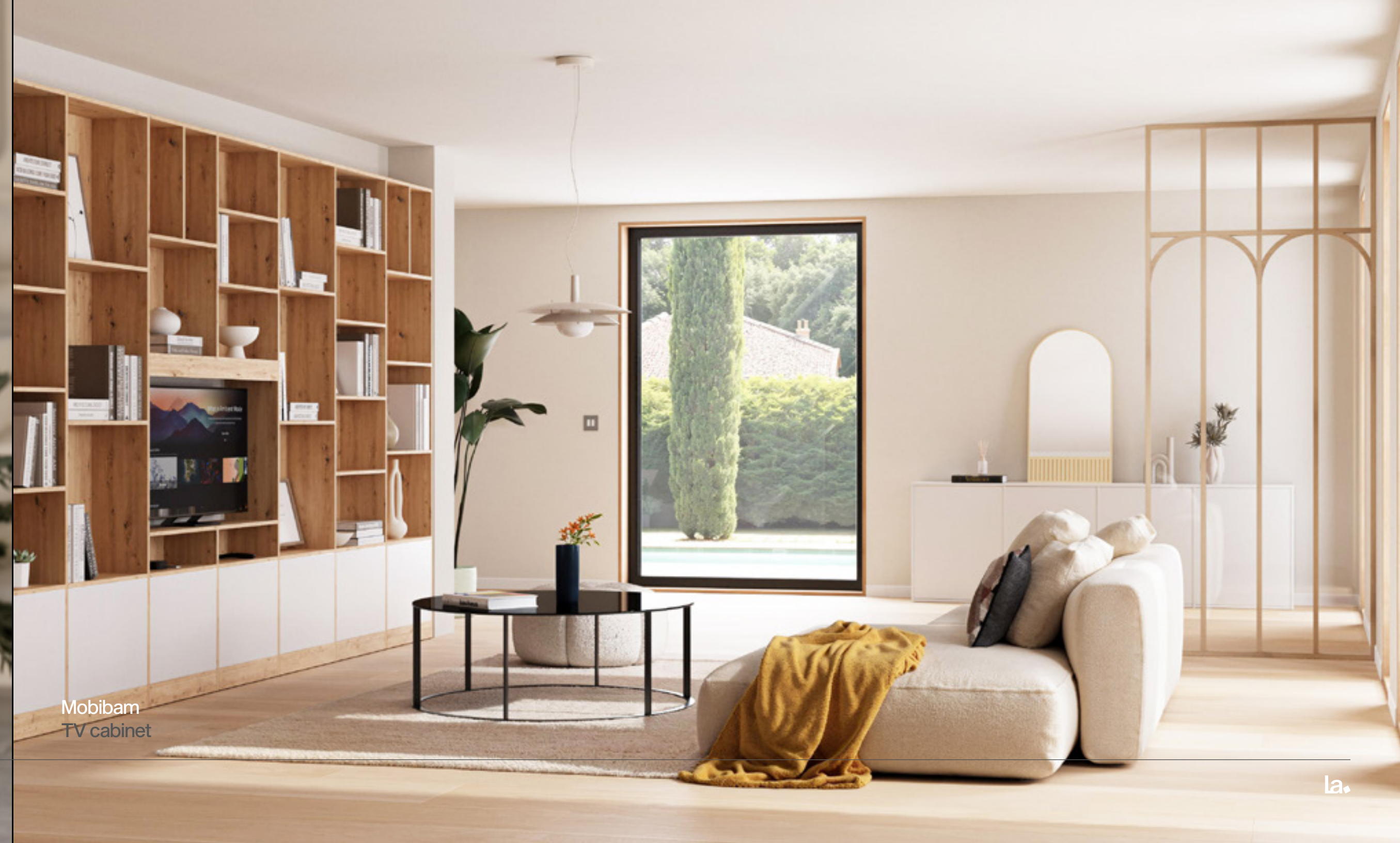
Mobibam TV cabinet