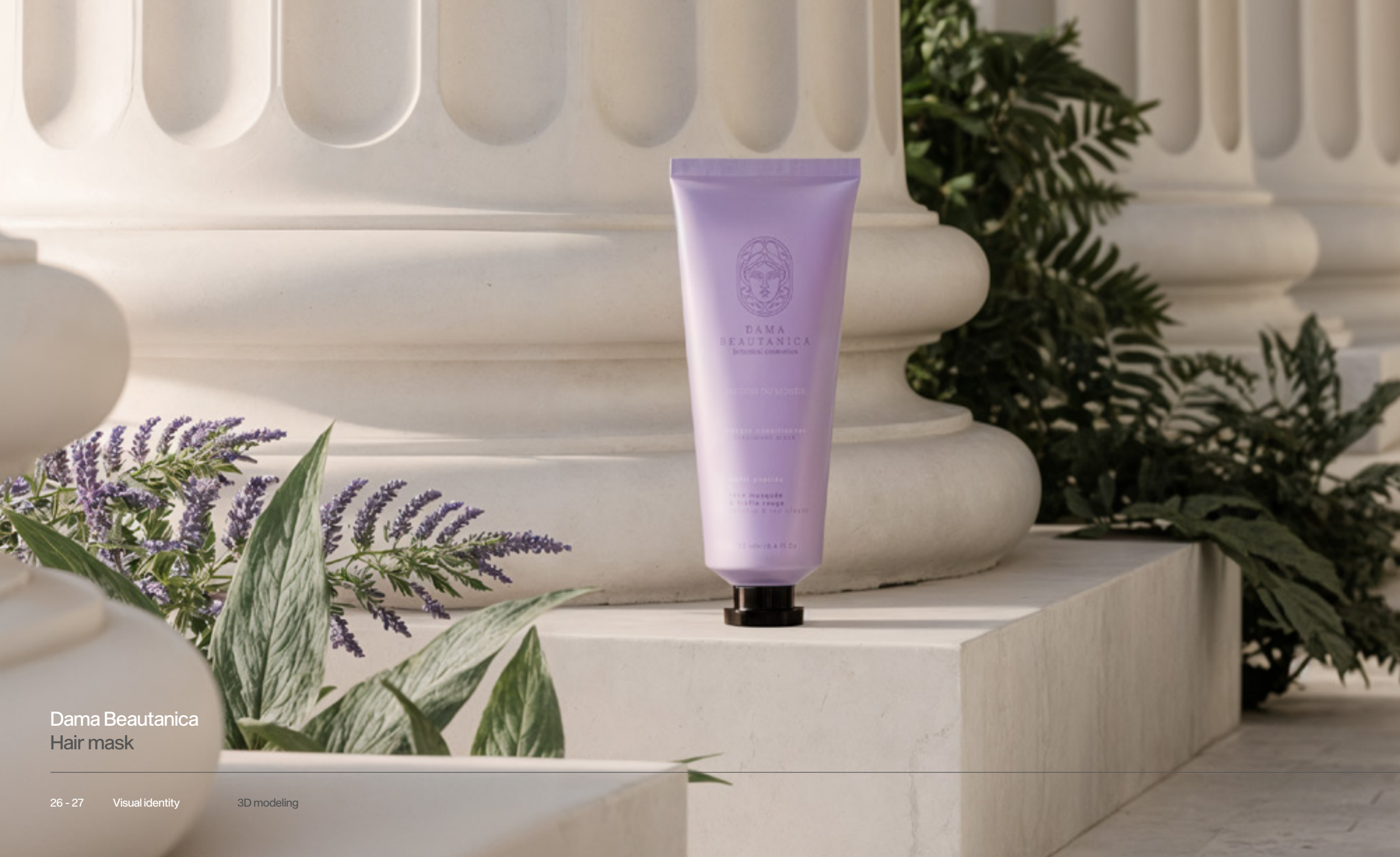
Dama Beautanica Hair mask