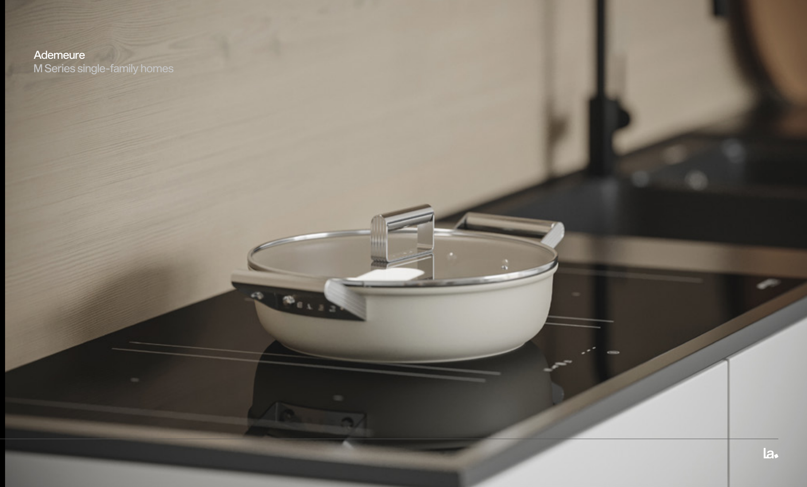
Ademeure M Series single-family homes

It's the meeting point between the precision of 3D and the emotion of the real.