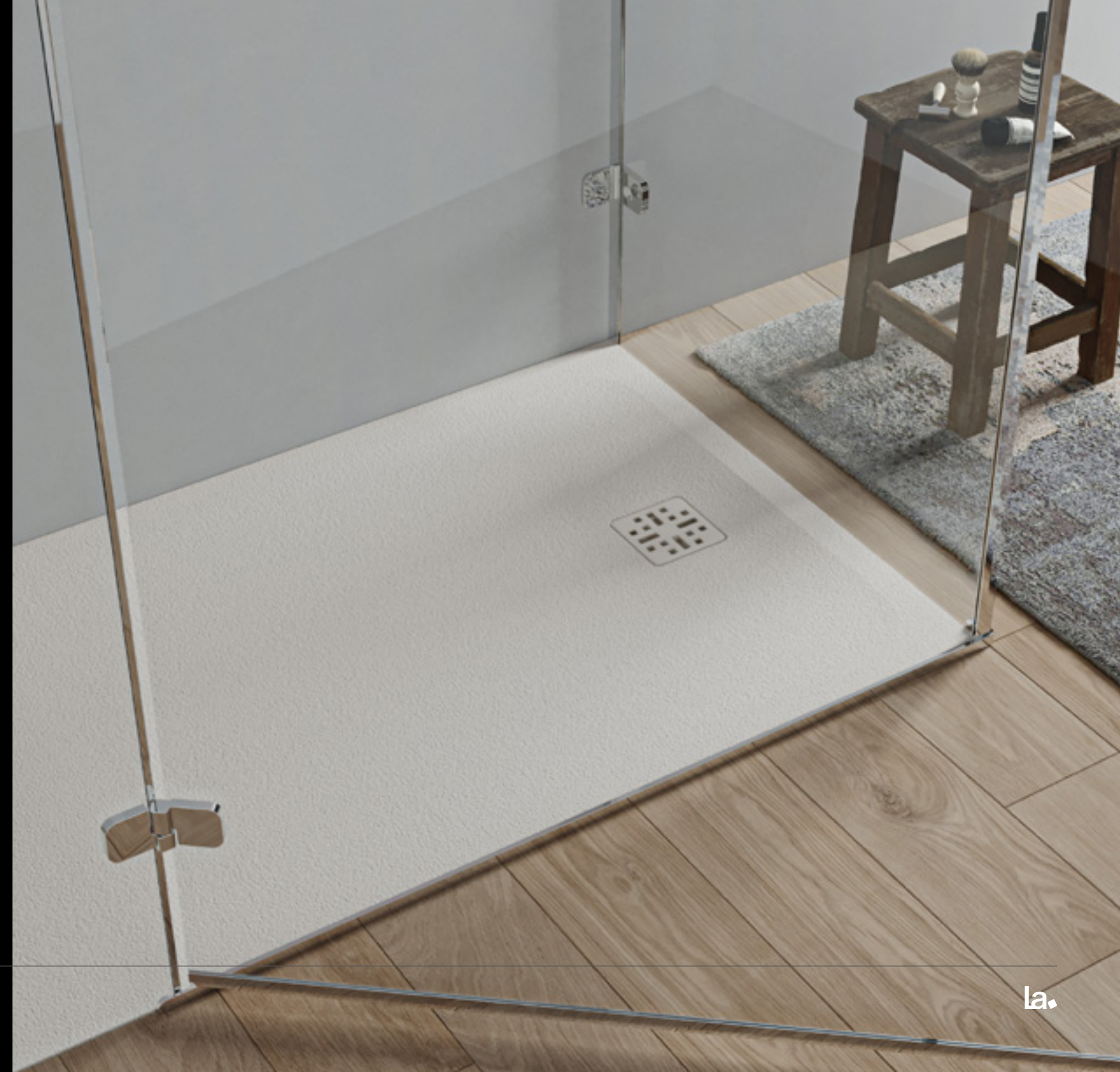
Domus Living Pietra shower floor