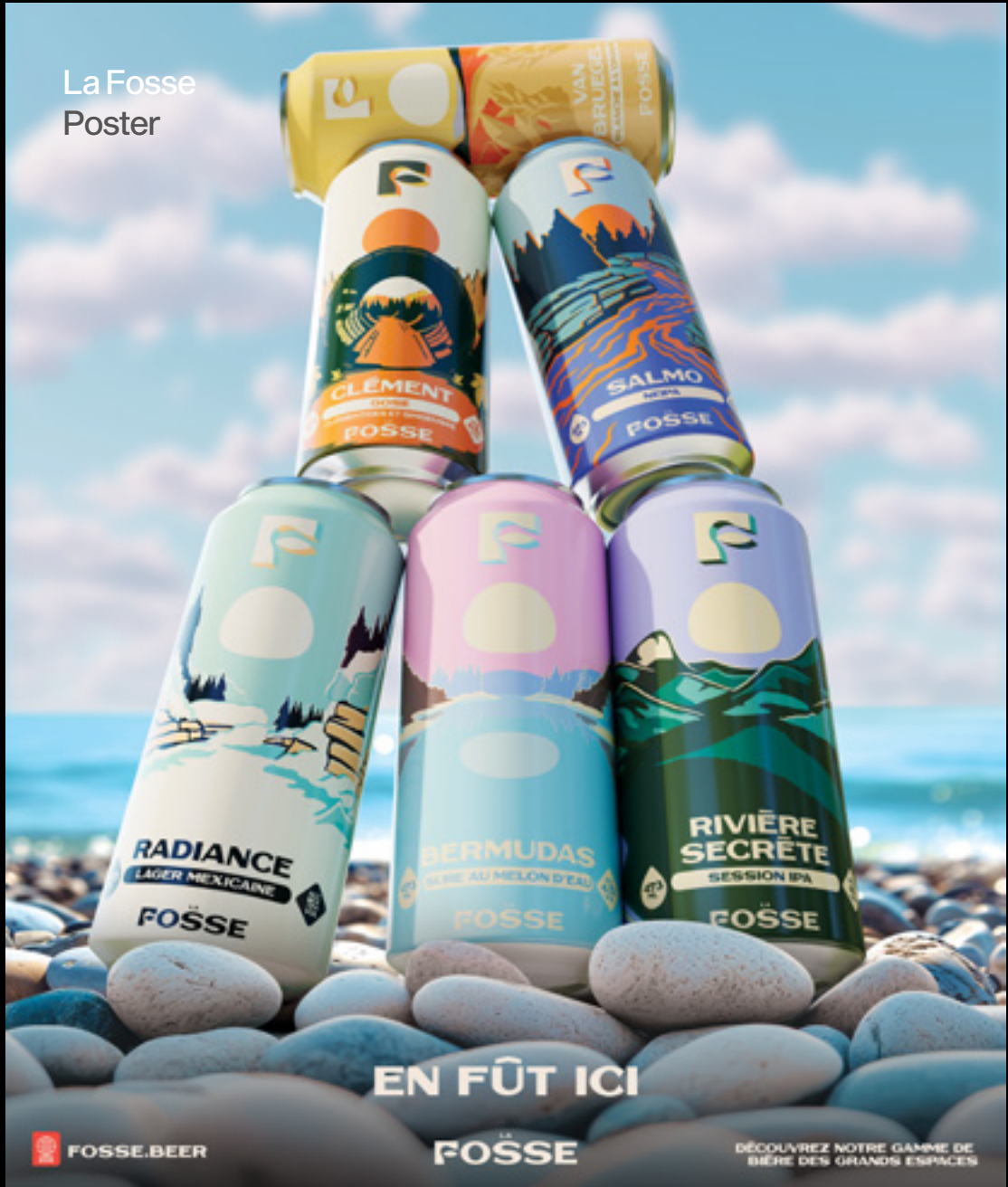
La Fosse Poster

Each packshot and every scene is crafted as a sensory experience. Our visuals elevate your products with a photographic mindset and an art direction that aligns seamlessly with your brand.